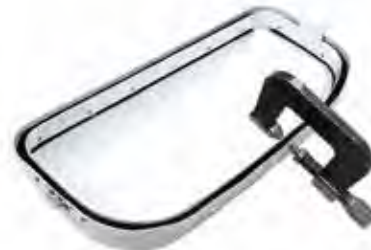
49-1610 in use!