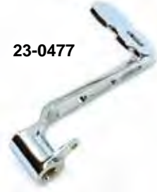
23-0477 Installed with pedal pad