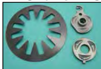
Soft Pull Clutch Ramp Kit includes spring plate for 1998-up Big Twins. VT No. 18-0559