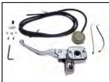
Hydraulic Clutch Handle Kit. Fits 1987-2006 VT No. 26-0996