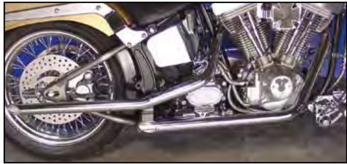
30-3015 Installed on 1984-99 FXST