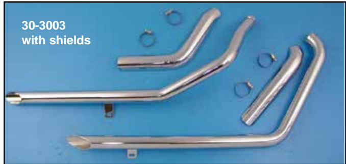
30-3003 with shields