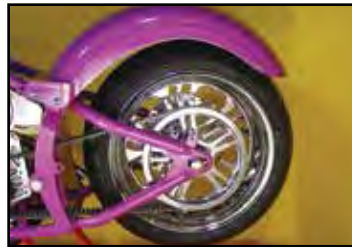
52-2901 Right Side

Wyatt Gatling Chrome Forged Billet Wheels for 1987-99 FXST. Wheels include adapter spacers and bearings as required. Use with 2000-up brake rotor and drive pulley.