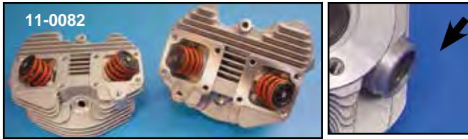
1978-84 Rubber Band Type