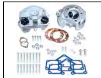
VT No. 42-0317

S&S Cylinder Heads for Shovelhead are complete with valve guides with seals and springs, collars, keepers, and valve for use with up to .590 lift.