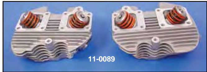
1966-77 O-Ring Type