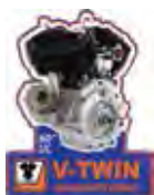
48-0498 80" UL