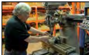
Welcome to Motor Shop