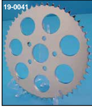
1973-84 Big Twin, 1979-81 XL

Rear Sprockets. Replace OEM 41470-73. Used on all 1973-86 FX, FXE, FXEF, FXWG, FXST, FL and FLH, 1979-81 Classic, cast or wire wheel. Dish type sprocket with 9.8 mm offset.