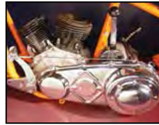
VT No. 22-0703 Installed