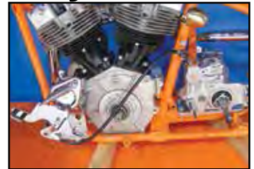
VT No. 22-0705 Installed