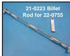
21-0223 Billet Rod for 22-0755