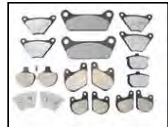
Brake Pad Assortment. VT No. 23-0000