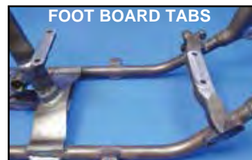
FOOT BOARD TABS

Rear Engine and Front Transmission Mount is of forged steel, with bushing installed. Transmission mounts incorporate a formed reinforcement strap to connect the two tier support strap assembly, all of which is constructed accurately of blanked and formed stampings.