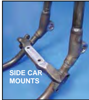
SIDE CAR MOUNTS