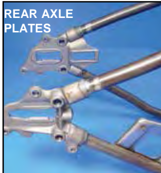
REAR AXLE PLATES