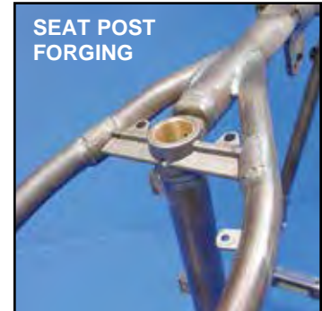
SEAT POST FORGING

Forged Neck yields the hallmark look of this replica, which will accept a neck lock and glide damper stud. Top engine mount has key hole slot which is the 1953-57 type. Spark and throttle cable mount tabs are also provided.