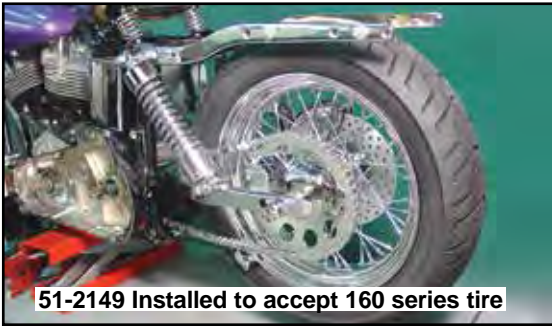
51-2149 Installed to accept 160 series tire