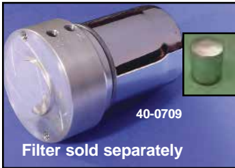
40-0709 Filter sold separately

Early Style Oil Filter features a chrome spin on filter. VT No. 40-0796