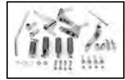
VT No. 22-0700