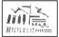
VT No. 22-0701

XLH-XLCH Forward Controls are chrome plated and complete as pictured for right and left sides for 1957-78 models with mechanical brakes. Purchase longer motor mount bolts separately. Note: Front Pipe may have to be indented for clearance.