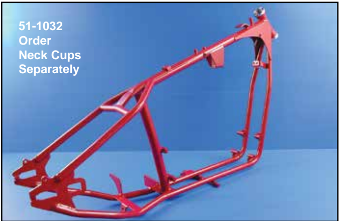
51-1032 Order Neck Cups Separately

Frames include a suggested parts listing to aid in construction.