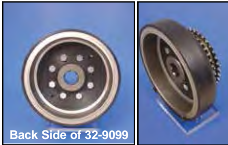
Back Side of 32-9099

Alternator Rotor by Volt Tech features vibration proof magnet construction, as magnets are held in place by a stainless steel non-magnetic insert for durability. Unit includes sprocket. OE type has stock type magnets.