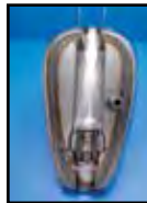
38-0132 Rolled Bottom Edge