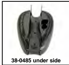
38-0485 under side