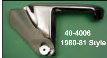
40-4006 1980-81 Style