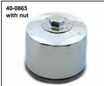
40-0865 with nut

Magnetek™ Oil Filters feature a magnetic ring in center tower to trap particles less than 10 microns which could have escaped thru the filter wall.