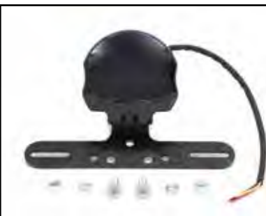
Skull Tail Lamp fits VT No. 33-1475

Warranty LED Boards will be warranted only. No credit will be issued on any lamps or components with the 33 prefix. Lamps will either be exchanged or repaired and returned to the dealer.