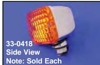
33-0418 Side View Note: Sold Each