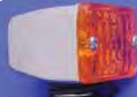
33-0420 Side View Note: Sold Each