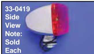
33-0419 Side View Note: Sold Each