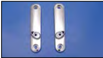
Chrome Turn Signal Bracket Set fits 1997-13 Road King Nacelle models. Mount holes are 6 \frac{3}{4} ". VT No. 31-0964