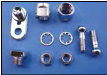
Chrome Turn Signal Swivel Mount Assembly for 1988-up FXST and 1991-up FXD models. VT No. 31-0582