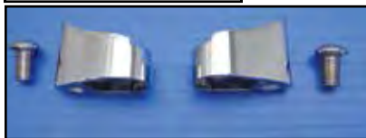
Chrome Short Rear Turn Signal Mounts move turn signals in 1 \frac{1}{2} " on each side for 1984-98 FXST, 1973-85 FX models, pair. VT No. 31-0554