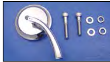
Chrome Round Mirror with billet stem. VT No. 34-1585