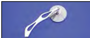
3" Billet Round Mirror with flame stem, sold each. VT No. 34-0448