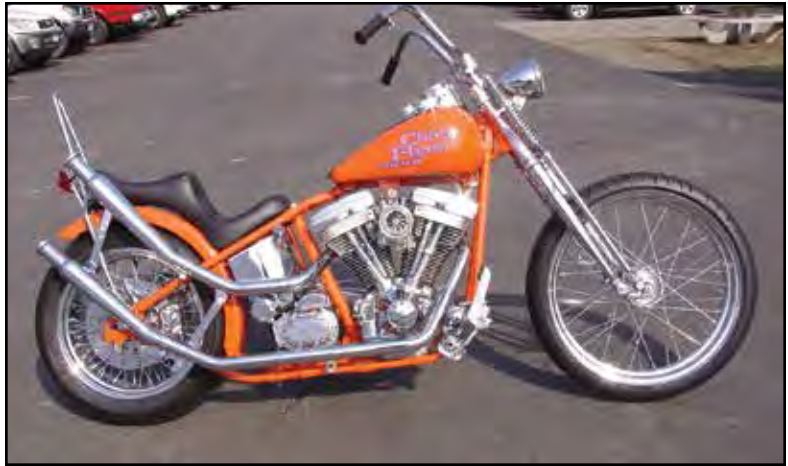
Cincy Flyer from the 2008 show, built with the 51-1957 frame.