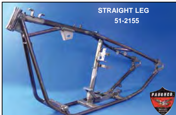
STRAIGHT LEG 51-2155

Bolt On Hard Tail Units to 1990-98 FXD-FXDWG models. Use stock rear wheel or fit up to 200mm width. Order battery box separately.