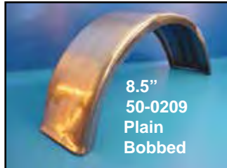
8.5" 50-0209 Plain Bobbed

Unfinished Heavy Duty Flat Fenders are rolled of 16 gauge steel, available in 5", 6", 8", or 9" widths and may require trimming and finishing for chain relief. Note: The 5" and 6" fenders are 1/4 deep, the 7", 8", and 9" are 1/8" deep. Note: End shape.