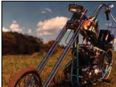
Original Stinger II Design on Rigid XL by Ron Yurich of New Britain, CT 1970.

High Back Seat Replica of Captain America Style of 1969 features chrome buttons and 14" back height for Rigid Frames only. Requires tall sissy bar recommended for support. Chrome sissy bar and gas tank also available.